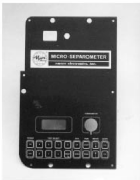
FIG. 1 Micro-Separometer Mark V Deluxe and Control Panel