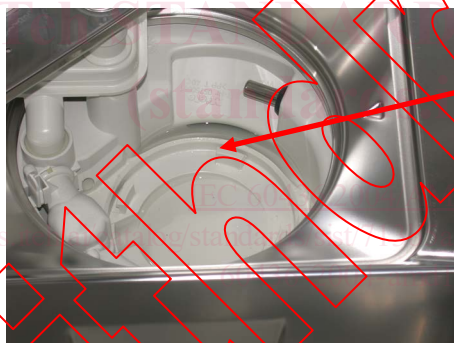
Maximum water level at the end of programme

The water level left in the sump is used as an indicator of the drain pump performance. The water level shall be measured at the completion of a cycle by removing the sieve. There is no adjustment for this parameter—a machine that operates outside the specified range will require servicing.