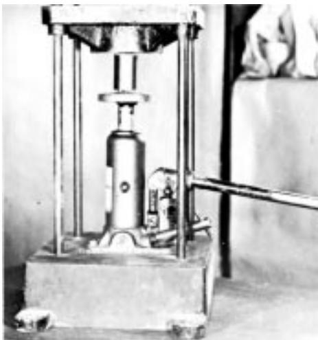
FIG. 2 Hydraulic Press