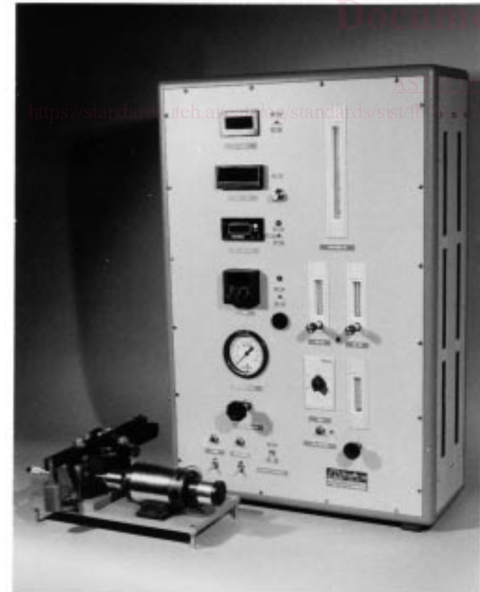
FIG. 1 Ball-on-Cylinder Lubricity Evaluator

NOTE 1— Warning: Compressed gas under high pressure. Use with extreme caution in the presence of combustible material, since the