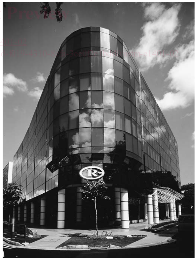
FIG. 3 Four-Side SSG System