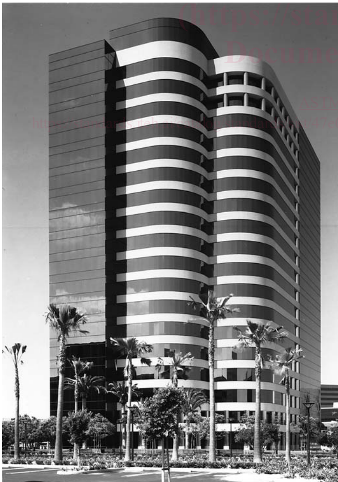
FIG. 2 Two-Side SSG System

16.3.2 A four-side SSG system can provide the aesthetic appearance of an all-glass or panel facade with no visible metal parts and relatively narrow sealant or other joints between panels. With no exposed metal parts and completely sealed joints, these systems can be very energy efficient compared to conventional metal and glass curtain wall or window systems. They also can have a higher degree of risk than two-side SSG systems since they rely only on the adhesion of a structural sealant to retain the glass lites or panels. With no exterior metal