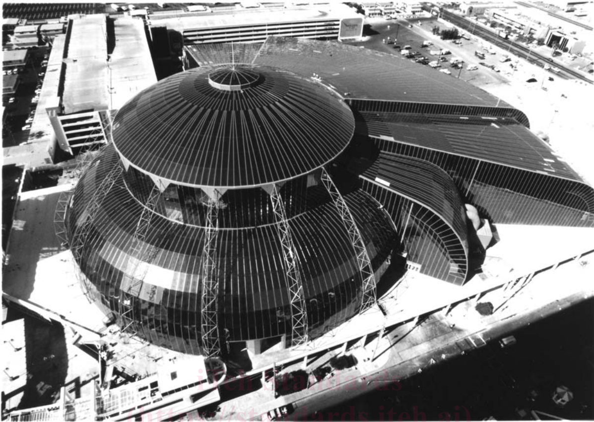
FIG. 5 Sloped SSG System

sealant at the edges of the vision lites to transfer applied loads to the glass mullions. This system features a maximum see-through capability (Fig. 6).