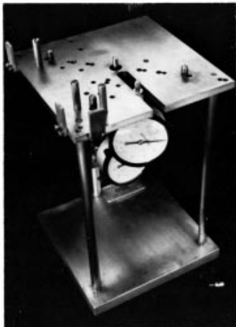
FIG. 1 Apparatus for Square Tile, Set Up for Measurement of 4 1/4- by 4 1/4-in. (108- by 108-mm) Tile