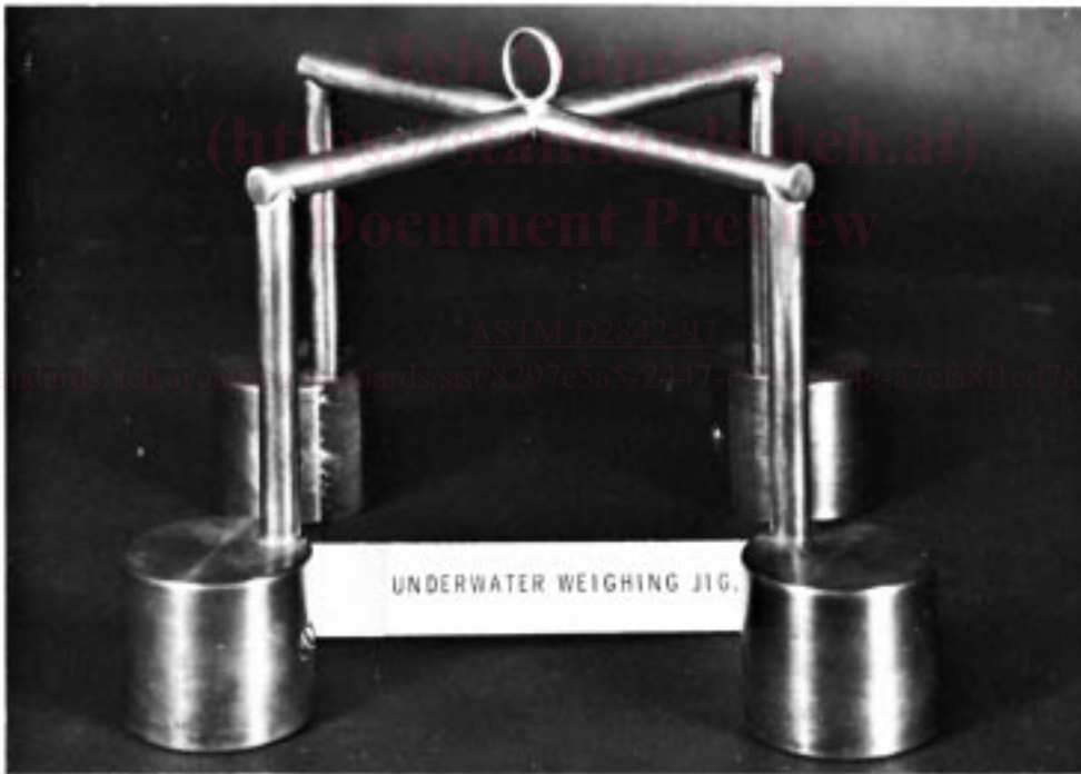
FIG. 1 Underwater Weighing Jigs

accommodate these larger specimens, the test equipment specified previously must be modified accordingly.