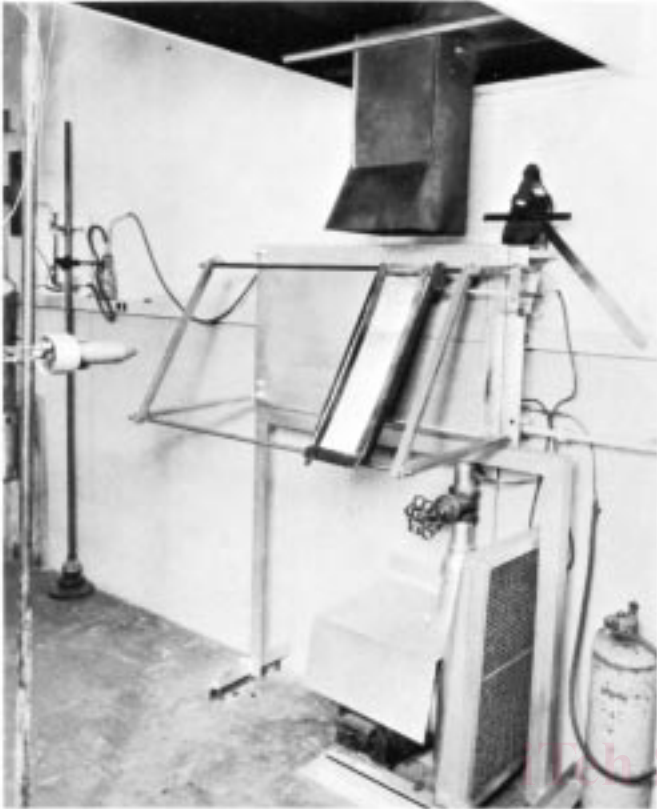
FIG. 1 Radiant Panel Flame Spread Test Equipment

at temperatures up to 820°C (1500°F). The panel shall be equipped (see Fig. 2) with a venturi-type aspirator for mixing gas and air at approximately atmospheric pressure; a centrifugal blower, or equivalent, to provide 47 dm 3 /s (100 ft 3 /min) air at a pressure of 0.7 kPa (2.8 in. water); an air filter to prevent dust from obstructing the panel pores; a pressure regulator and a control and shut-off valve for the gas supply.