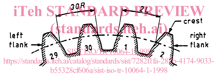
Fig. 1 Notation and numbering for external gear 30 R = pitch Nr. 30, right flank 2 L = pitch Nr. 2, left flank

Right and left flanks are denoted by the letters "R" and "L" respectively.