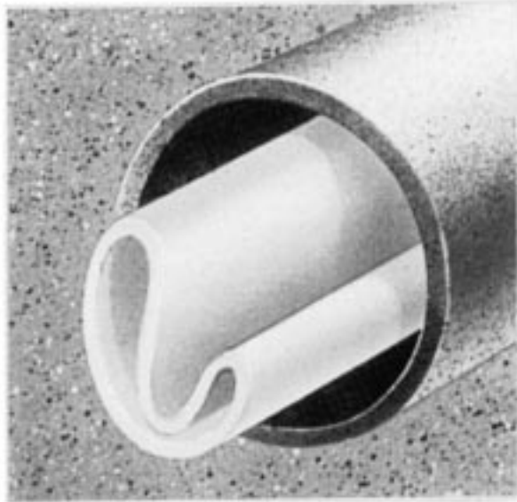
(a) Deformed Pipe