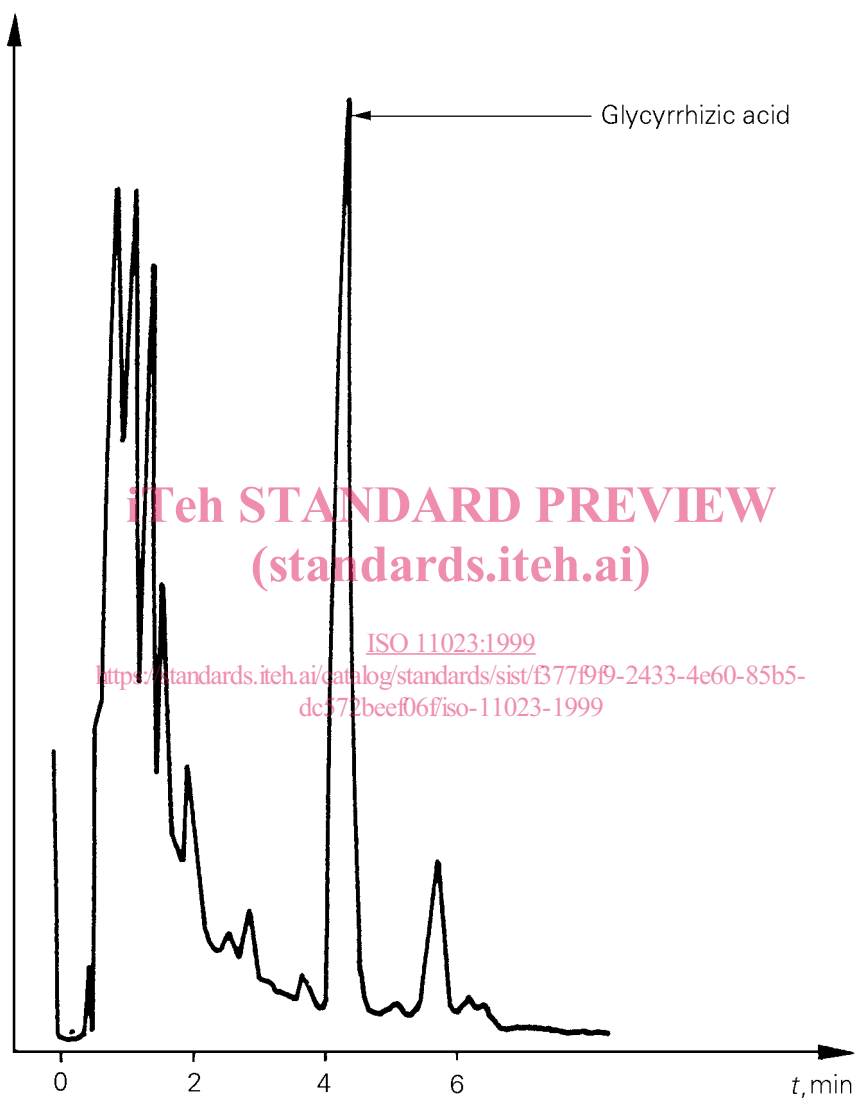
Figure A.1 — Chromatogram of a liquorice extract