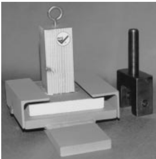
FIG. 1 Tensile Strength Test Specimen Assembly

9.1 Shear Strength (Rate-of-Shear Strength Development) :