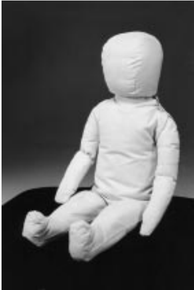
FIG. 1 CAMI Infant Dummy, Mark II