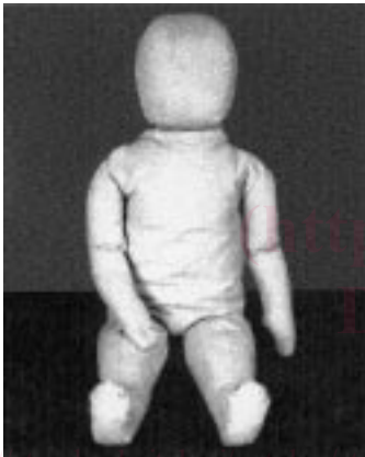
FIG. 2 CAMI Newborn Dummy