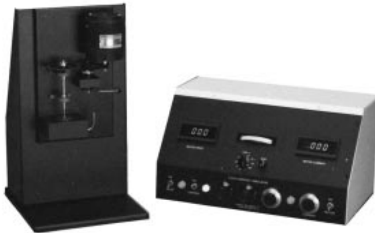
FIG. 1 Cold Cranking Simulator

function of viscosity. Test oil viscosity is determined from this calibration and the measured rotor speed.