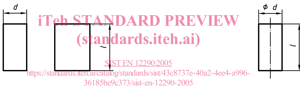
Figure 2 - Type 2 specimen geometry

Recommended dimensions are given in Table 2.