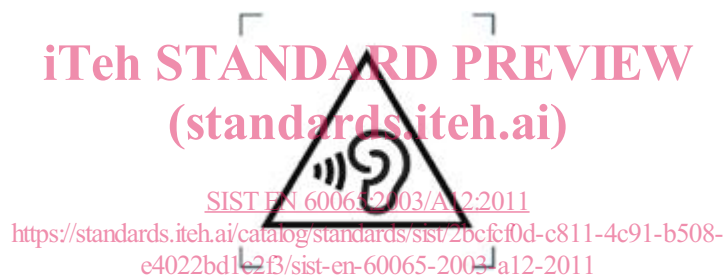
Figure 1 – Warning label (IEC 60417-6044)

To prevent possible hearing damage, do not listen at high volume levels for long periods.