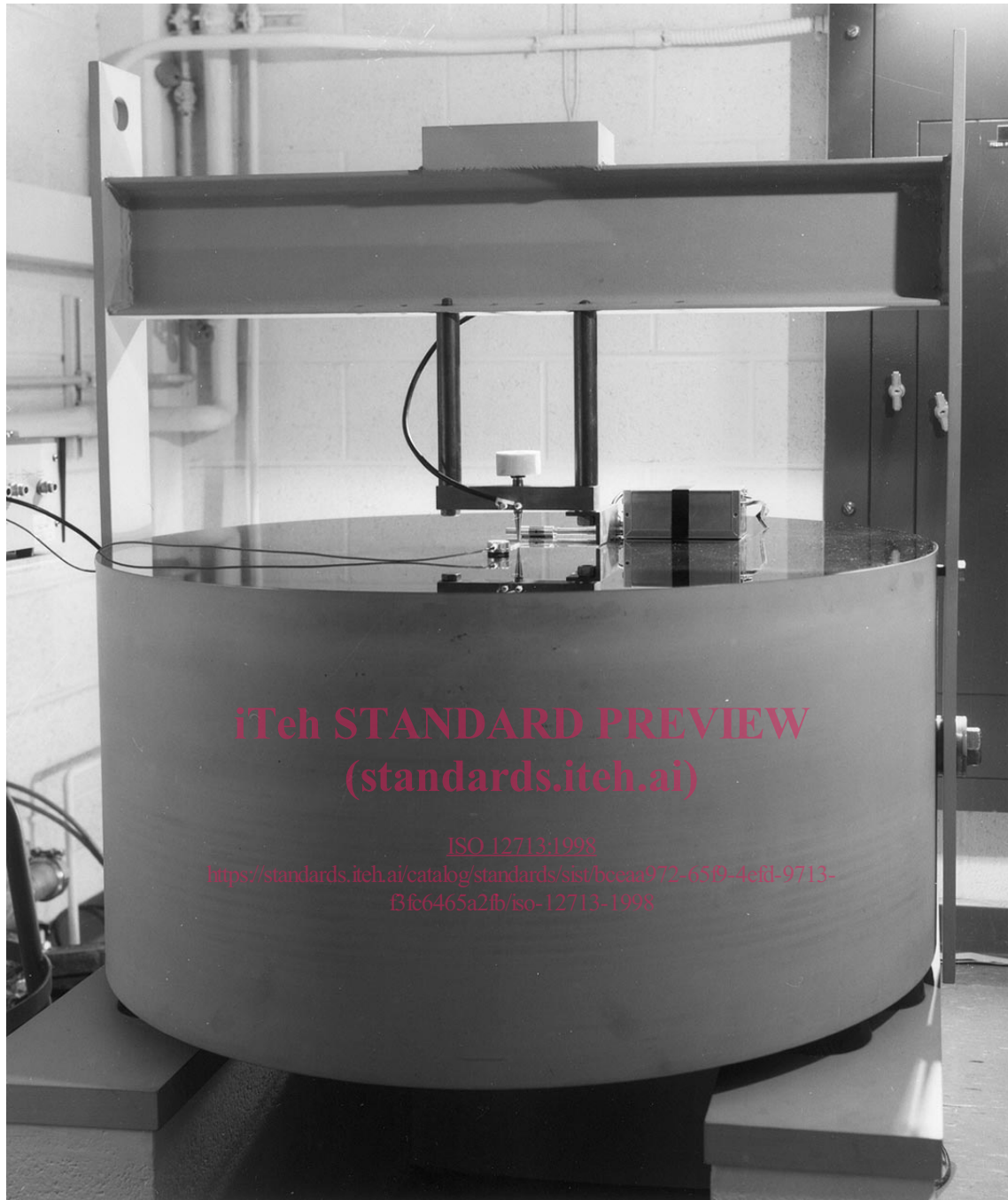
Figure 2 — Photograph of the steel block with the calibration apparatus in place