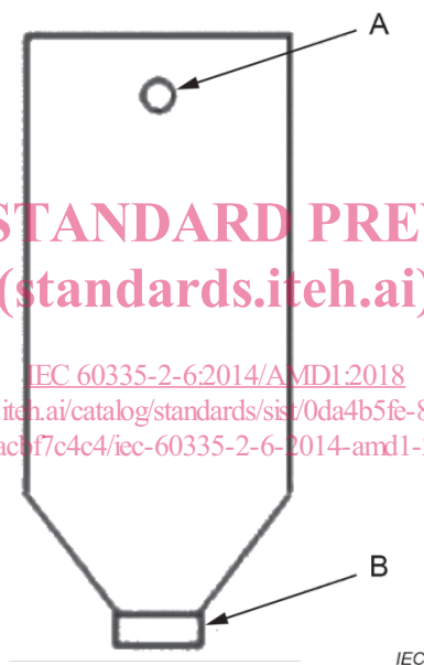
Figure 106 – Detail of bottle cap and position of hole

iTeh STANDARD PREVIEW (standards.iteh.ai)