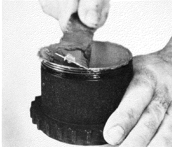
FIG. 2 Preparing Sample for Penetration Measurement

8.2.2 Worked Penetration —The following sections describe the procedure for preparation of samples for worked penetration: