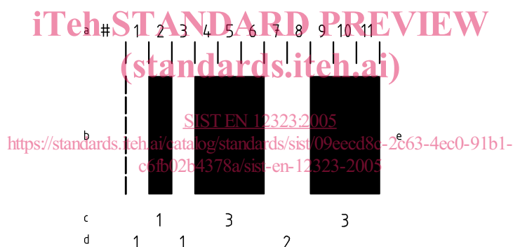
Figure 4 – Symbol character value 33

Symbol character parity is defined by the sum of the bar modules in any symbol character. In "Code 16K" this sum shall always be odd (odd parity). This odd parity feature enables character self-checking to be carried out. Figure 4 illustrates the symbol character value 33.