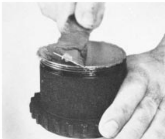
FIG. 2 Preparing Sample for Penetration Measurement