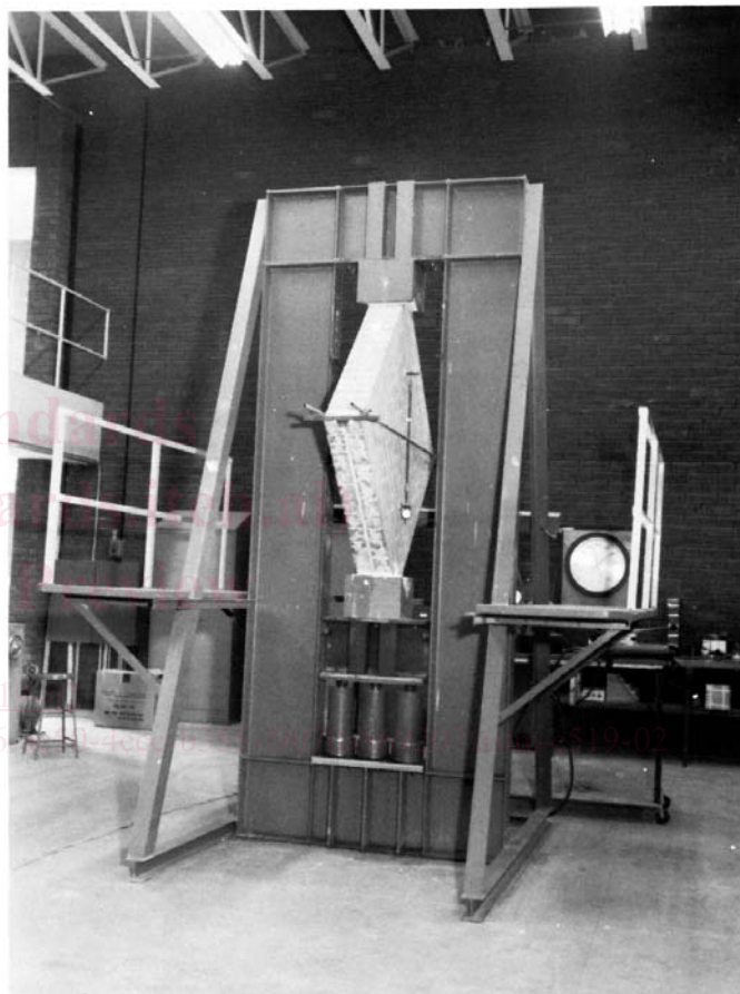
FIG. 1 Apparatus for Determination of Diagonal Tensile or Shear Strength Masonry Assemblages

E 575 Practice for Reporting Data from Structural Tests of Building Constructions, Elements, Connections, and Assemblies 5