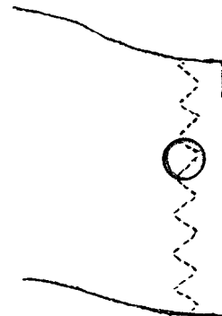
FIG. 1 Multiple Stitch Zigzag

complex machine stitch pattern , n — in home sewing , a machine stitch pattern formed when two or more simple machine stitch patterns are combined in one repeating unit. (Compare simple machine stitch pattern.)