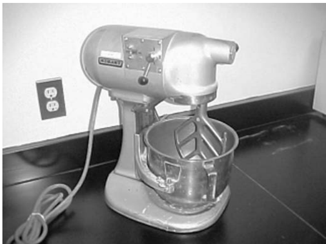
FIG. 1 Five Quart Hobart Mixer