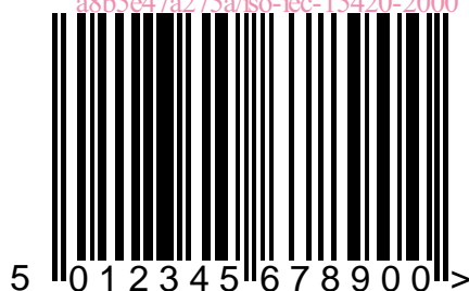
Figure 1: EAN-13 bar code symbol

https://standards.iteh.ai/catalog/standards/sist/717b522e-e1db-45c6-bb6c-a8b5e47a275a/iso-iec-15420-2000