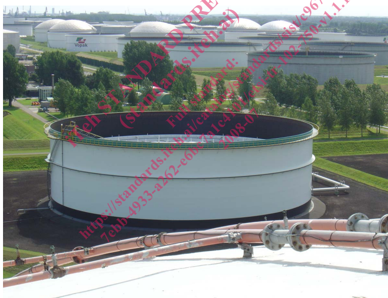
Figure 2: Example of an external floating roof tank with still pipe and TLPR

All external floating roof tanks are big ( \Phi = 30 - 80 m and \sim 20 m high) which implies a low density of gauges and always located in industrial areas with very restricted admittance. 100 floating roof tanks in a single area is considered as a big tank farm.