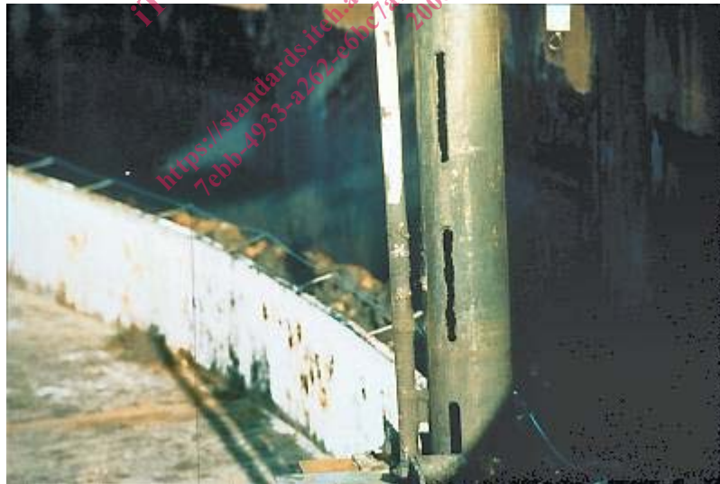
Figure 3a: Example of slotted still pipe.