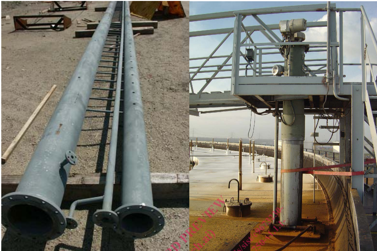
Figure 3: The perforated still pipes ready for installation in EFRT (left); operational perforated still pipe with floating roof (right)