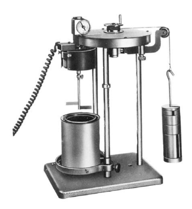
FIG. 1 Stormer Viscometer with Paddle-Type Rotor and Stroboscopic Timer