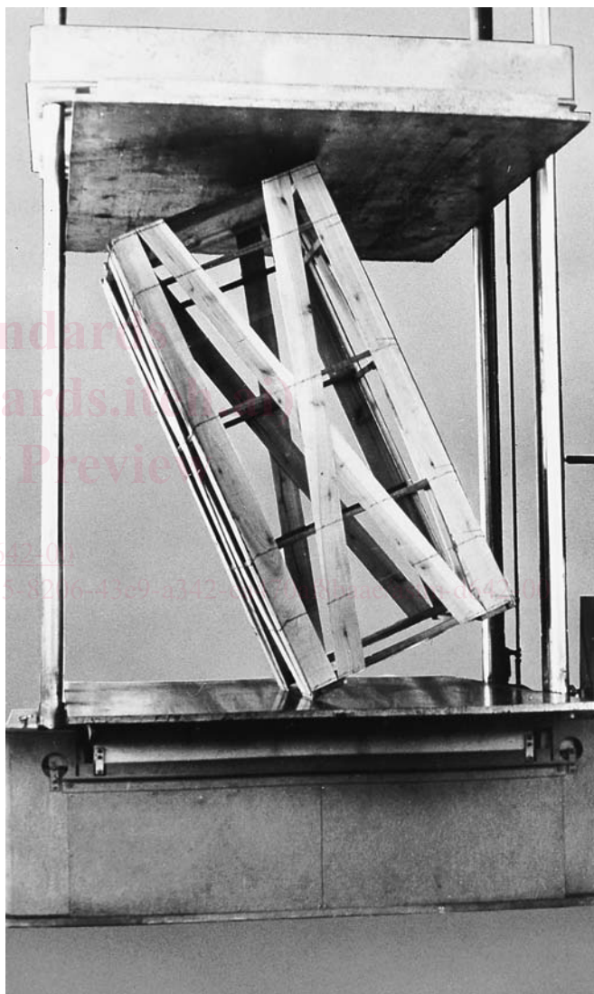
FIG. 1 Compression Applied Diagonally Opposite Edges