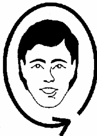
Figure 2 — Illustration of the circumference of the head A 1