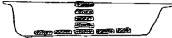
Figure 1 – Load application (for each user)