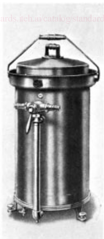
FIG. 1 Stillman-Type Portable Cubic-Foot Standard

5.1 The capacities of cubic-foot bottles, standards, and so forth, are indicated by their names. A portable cubic-foot standard of the Stillman type is shown in Fig. 1 and a fractional cubic-foot bottle is shown in Fig. 2. The temperatures and pressures at which these types of apparatus are used must be very close to those existing in the room in which they are located. Since these containers are generally used as standards for the testing of other gas-measuring devices, the rate at which they may be operated is of little or no importance. It will always be low, and probably nonuniform, and in any given instance will be affected by the test being made and the connections used.