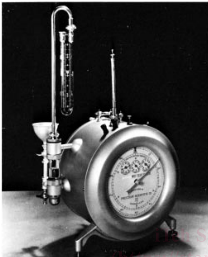
FIG. 3 Liquid-Sealed Rotating-Drum Gas Meter of 0.1 ft 3 per Revolution Size

across the meter, range from 5 to 1200 ft 3 /h. Liquid-sealed rotating-drum meters may be calibrated for use at any rate for which the pressure drop across the meter does not blow the meter seal. However, if the meter is to be used for metering differing rates of flow, a calibration curve should be obtained, as described in Section 20, or the meter should be fitted with a rate compensating chamber (see Appendix X1).