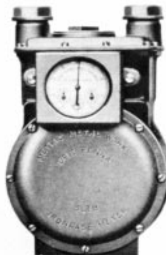
FIG. 4 Iron-Case Diaphragm-Type Gas Meter with Large Observation Index

10.1 Rotary displacement gas meters are mentioned here only to have a complete coverage of meters for gas, since meters of this type are of relatively large capacity, beyond that