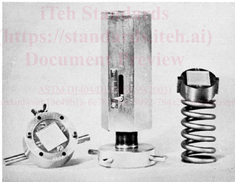
(b) Unassembled View