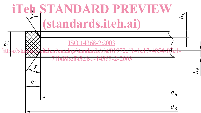
Figure 3 — Details of the gasket