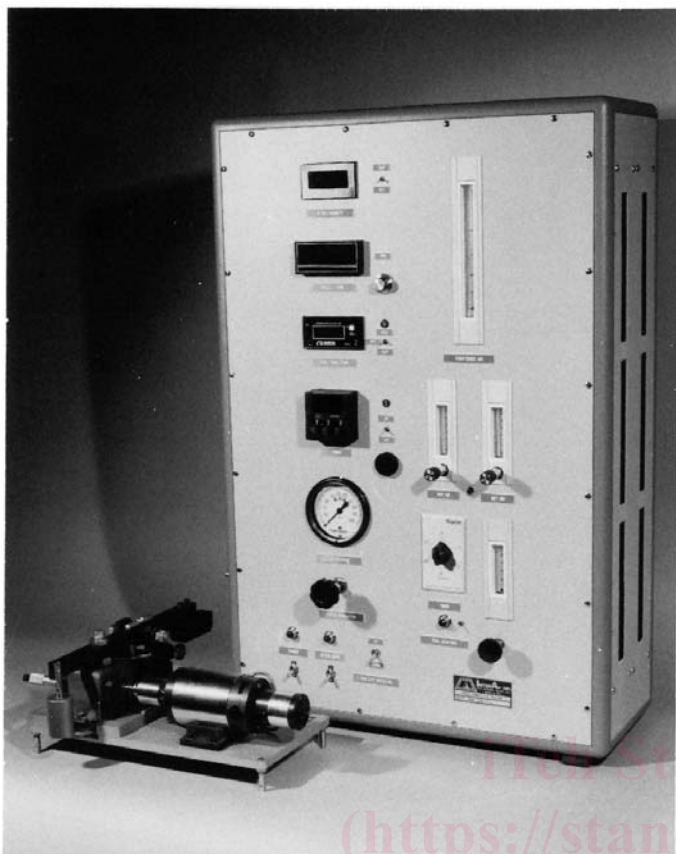
FIG. 1 Ball-on-Cylinder Lubricity Evaluator