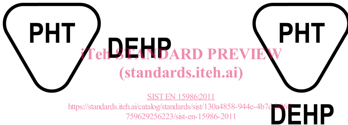
Figure A.1 — Example of the symbol for "CONTAINS OR PRESENCE OF PHTHALATE"