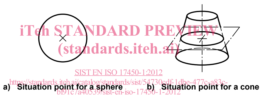
Figure 1 — Example of situation points

EXAMPLE In the case of a torus, there are two dimensional parameters, one of which is a size (the small diameter of the torus). Its skeleton is a circle and its situation features are a plane (containing the circle) and a point (centre of the circle).