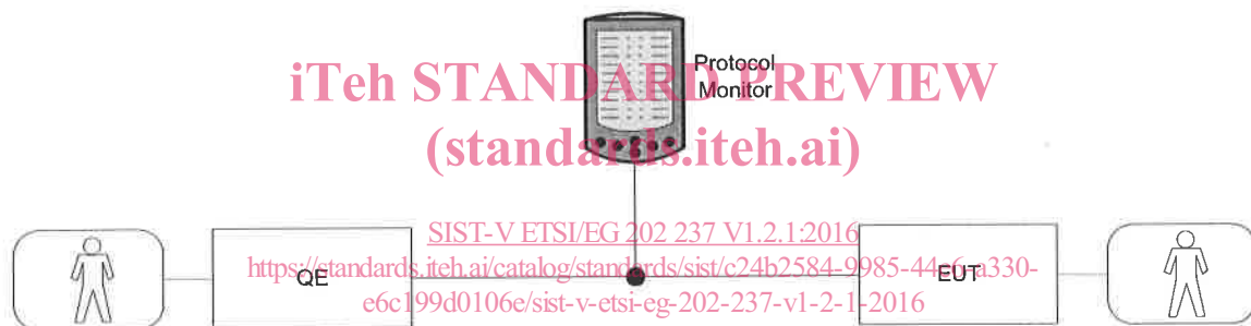
Figure 3: Interoperability testing with conformance monitoring

Although there are quite distinct differences between conformance testing and interoperability testing, it is valid to consider using the techniques together to give combined results. Such an approach will almost certainly involve some compromise and it is unlikely that it would provide the breadth and depth of testing that conformance and interoperability can offer when applied individually. However, some limited conformance testing with extensive interoperability testing, for example, may be useful in certain situations. The test configuration shown in figure 3 permits complete interoperability testing to be undertaken while limited protocol conformance monitoring takes place.