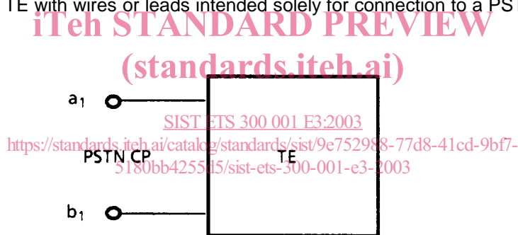
Figure 1.4.4.1.a: One-port TE

One-port TE is defined as TE with wires or leads intended solely for connection to a PSTN CP (see figure 1.4.4.1.a).