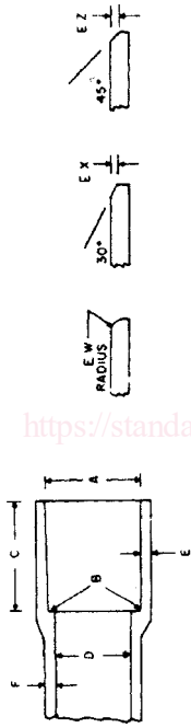
TABLE 1 Tapered Sockets for PVC Pipe Fittings, Schedule 80, in. (mm) A