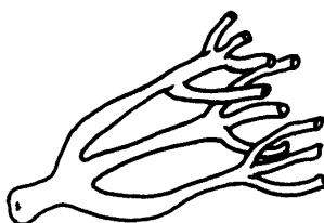
Figure 4 — Clove stem