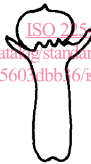
Figure 1 — Whole clove

ISO 2254:2004 https://standards.iteh.ai/catalog/standards/sist/f9226df7-4d91-4df3-9da8-3bb5603dbb16/iso-2254-2004