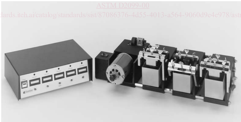
FIG. 1 Maeser Water Penetration Tester (continued)

electrode in the conducting solution. This causes a thyatron tube to fire, opening the relay and stopping the machine.