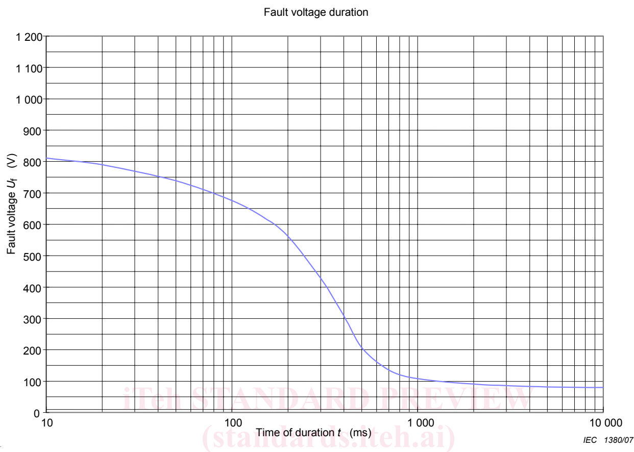
Figure 44.A2 – Tolerable fault voltage due to an earth-fault in the HV system

NOTE The curve shown in Figure 44.A2 is taken from IEC 61936-1. On the basis of probabilistic and statistical evidence this curve represents a low level of risk for the simple worst case where the low voltage system neutral conductor is earthed only at the transformer substation earthing arrangements. Guidance is provided in IEC 61936-1 concerning other situations.