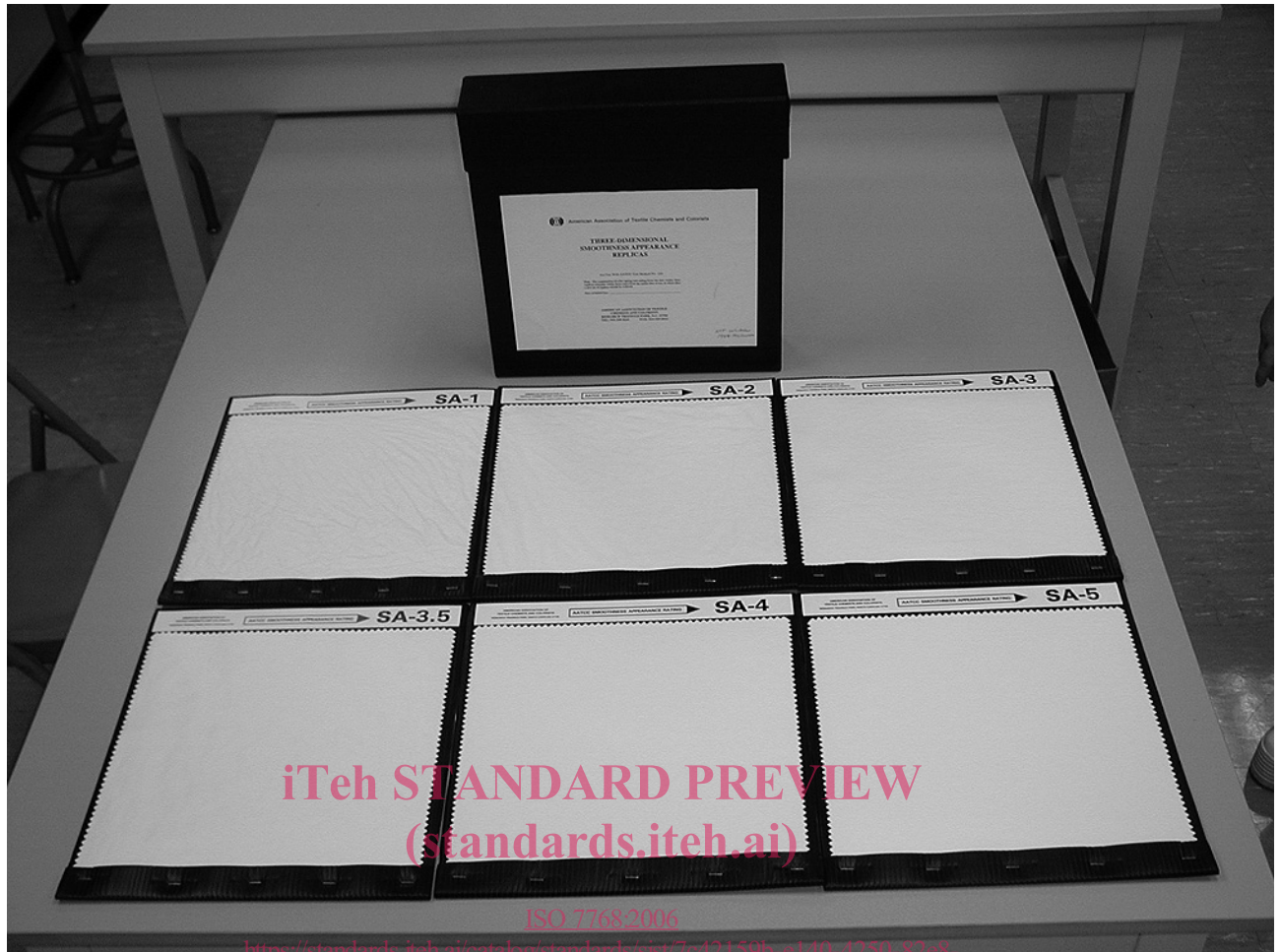
Figure 2 — Three-dimensional smoothness appearance replicas