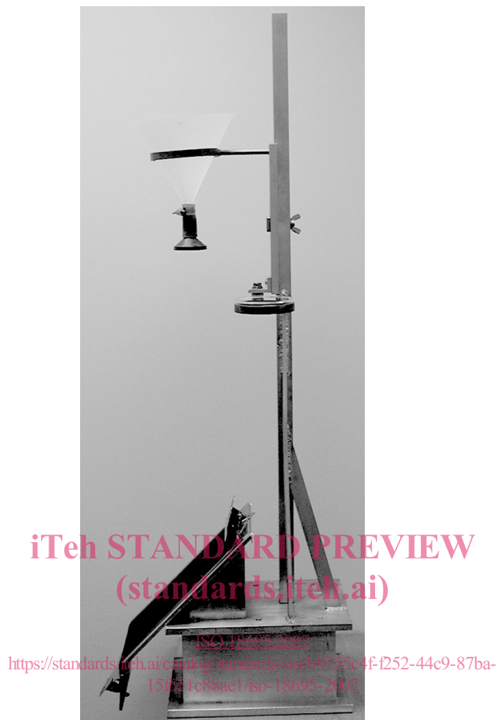
Figure 2 — Impact penetration tester — Type 2 tester