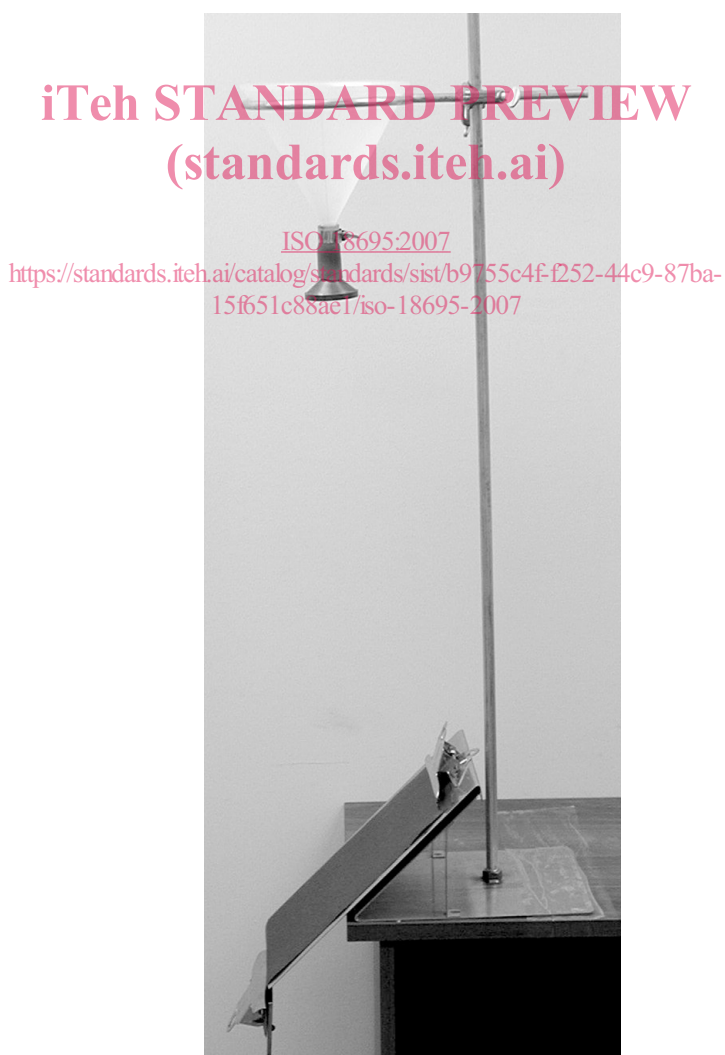
Figure 1 — Impact penetration tester — Type 1 tester