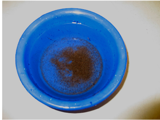
Figure 2 — Sediment layer (including enchytraeids)