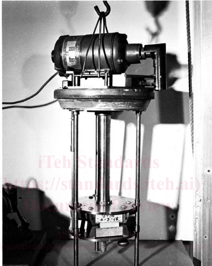
FIG. 4 A Motor-Driven Machine That Can be Used for Extension of Specimens at - 15°F (-26.11°C)

NOTE 1—When requested, only one or two of the standard materials may be tested with the sample. Likewise other substrates such as brick,