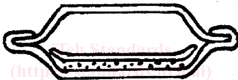
FIG. 2 Sample Pan Collapsed and Collected

9.4 Determine the temperature calibration corrections for other heating rates by programming a sharply melting standard (for example, pure indium metal) at these heating rates and observing the deviation of the known melt temperature as a function of the rate.