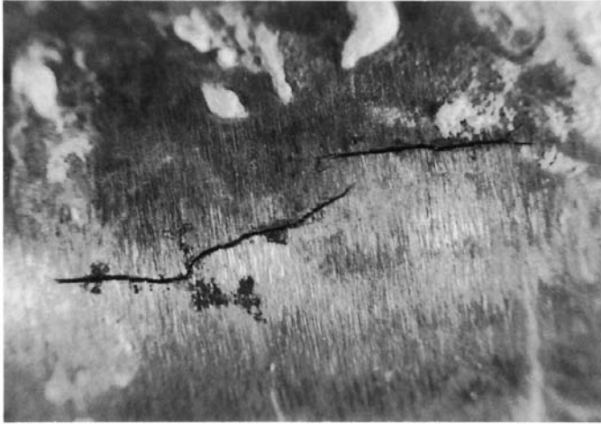
FIG. 2 Typical External Stress Corrosion Cracks (5× Magnification)

6.15 Electrical Transformer , isolation-type. (approximately 150 mV/150 AMP).