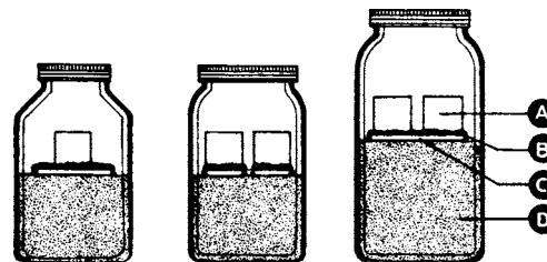
A—Wood cubes, 19-mm or 0.75-in. B—Test fungus growing over feeder block. C—Wood feeder block. D—Soil.

5.1 Purity of Reagents —Reagent grade chemicals shall be used in all tests. Unless otherwise indicated, it is intended that all reagents shall conform to the Specifications of the Committee on Analytical Reagents of the American Chemical